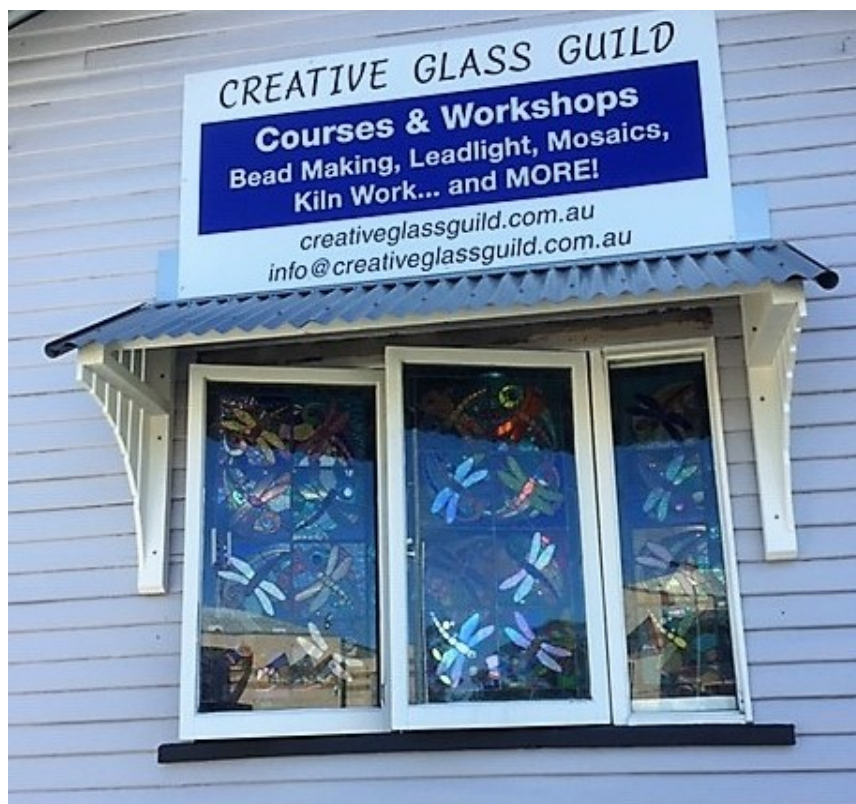
Awnings have been fitted over the back and side windows at our Fulcher Road premises to keep the workshops cooler and weatherproof.