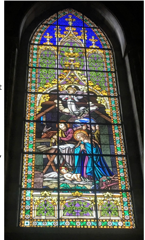
Pictured (above): One of the beautiful windows of Quito's Basilica del Voto Nacional , the largest neo-Gothic church in the Americas.

Below: The spectacular rose window in the west transept captures the eye and the imagination with its exuberance of colour and fine detail.