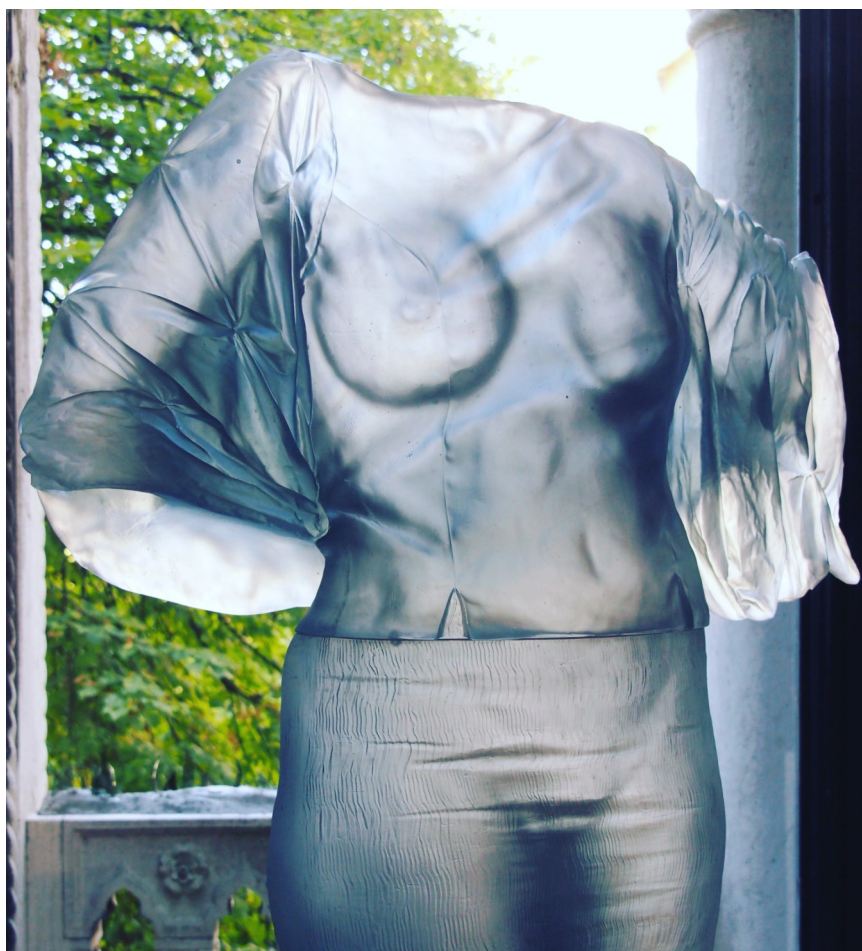
This example of a woman's torso at the 2017 Glasstress Exhibition is typical of the exciting range of exhibits which varied dramatically, and demonstrated the amazing versatility of glass as a creative medium.